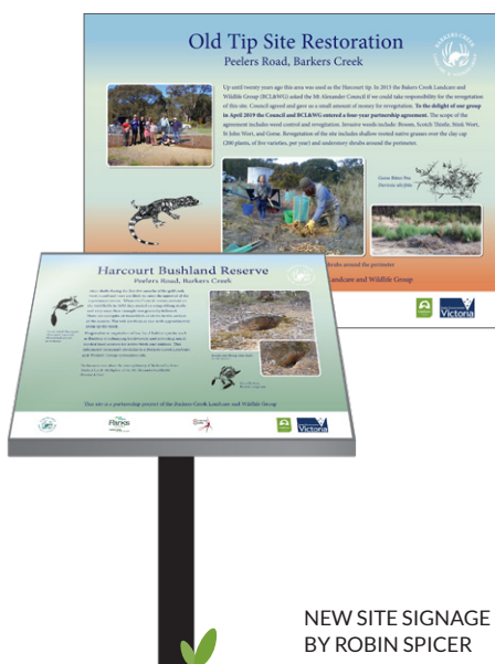
NEW SITE SIGNAGE BY ROBIN SPICER

The survey had a range of questions which focused on what are the things that you enjoy most about your involvement with the group and what projects do you think are most valuable in restoring our environment.