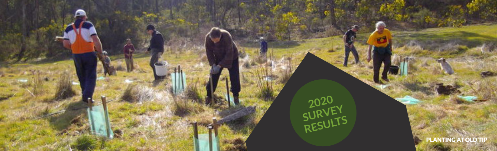
PLANTING AT OLD TIP