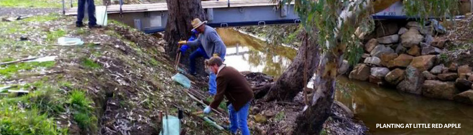
PLANTING AT LITTLE RED APPLE