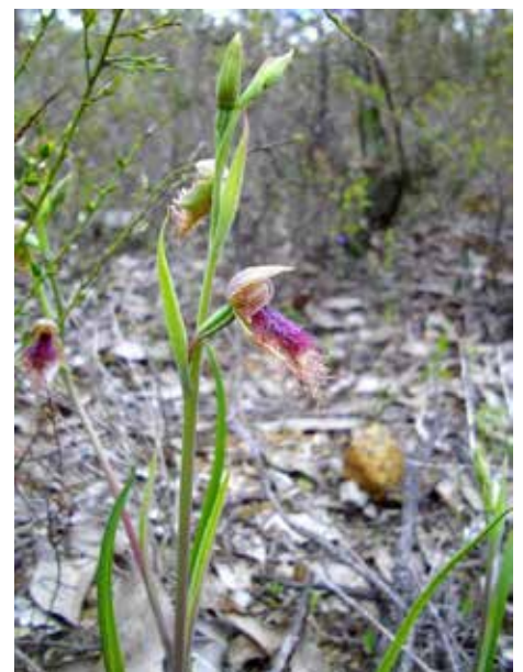
TOP Group photo taken during the 2014 AGM working bee at Cat Dam Track (behind Wendy McClellands old property) in the Diggings Heritage Park - Barkers Creek.

Comprehensive notes of all the things that were discussed form the basis of our Barkers Creek Landcare & Wildlife Group Action Plan 2015 – 2019 .